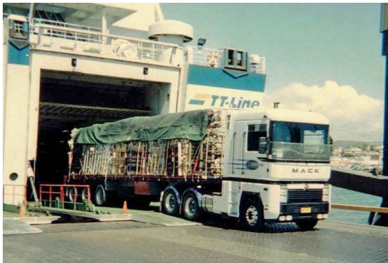
Mack Magnum with Cummins Gen 2 'Signature' motor pulling its trailer off the Tasmanian Bass Strait ferry.