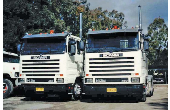
The Scania 143 cabovers with 450 HP.