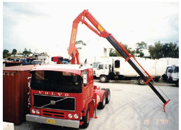
The Volvo F10 prime mover with Hiab crane.

He's owned an Atkinson, Thames Trader, Macks were two Magnum cabover B-doubles, R-model, Fleetliner and Superliner, Scania 112, 113, 142 and 143, three MAN's with pogo stick gearboxes (you move the gearstick up and down), a Volvo prime mover with Hiab crane, three T401 Kenworths, a cabover Peterbilt with two-cycle Detroit, a cabover International with a Cummins, a White Road Boss with an 8V71 2-cycle GM, and five NL-series Volvos. He