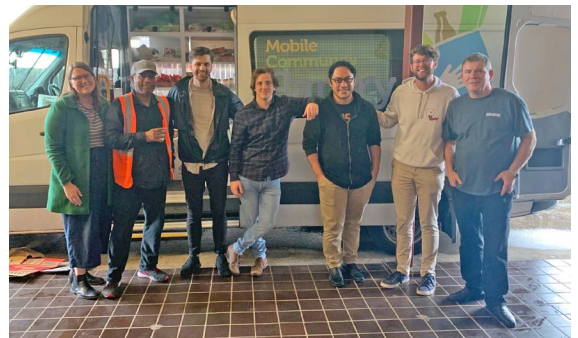
Anglicare driver and food van, with volunteers, at Liverpool South Anglican Church, NSW.

46 "Then they will go away to eternal punishment, but the righteous to eternal life.