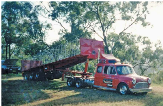
Mini-minor miniature semi-trailer originally yellow but later painted in Cawdor Haulage red for a novelty exhibit at truck shows.

did truck racing in a Volvo N12 which was also a work truck. With this history he could open a truck repair shop!