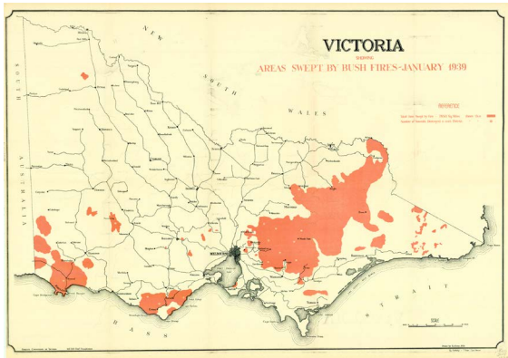
Nearly two million hectares of Victoria burned on Black Friday 1939.

The first known use of the term “Black Friday” referred to the crash of the US gold market in 1869. Two Wall Street financiers, Jay Gould and Jim Fisk, had conspired to artificially inflate the gold price ... however, their devious plan eventually collapsed – taking the stock market along with it and sending many innocent people into bankruptcy.