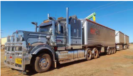
Loading wheat from a mother bin into the 1,000th built Robuk trailer.