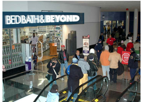
Black Friday Sales.

Later, retailers worked to expunge “Black Friday” of its negative connotations, replacing the origins of the term with a story that had a more positive spin. “Black Friday” became a pre-Christmas shopping event, where discounted goods attracted crowds of shoppers. The surge in sales was said to move retailers who had been operating at a loss – in “the red” – back into “the black” before the end of the year. Today, “Black Friday” is a well-known retail event, inviting savvy shoppers to snap up bargains before Christmas!