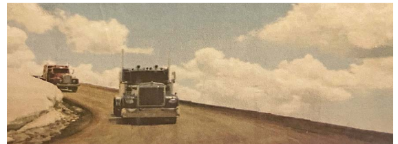
Trucks descending Pikes Peak. There is no place to pull off the road, so the picture was taken through a windscreen.

"Pikes Peak or Bust" the sign read on the back of a 1967 Kenworth from California at the 28th Annual American Truck Historical Society's National Convention and Antique Truck Show in beautiful Colorado Springs, Colorado.