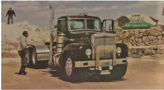
We made it to the summit of Pikes Peak!

This was my first experience of Pikes Peak, and I was awed at the beauty of the lakes, trees and all the snow. When we reached the top, it was cold and windy. The view was breathtaking.